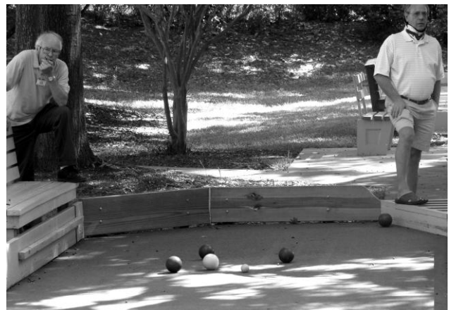
Official Bocce Judges