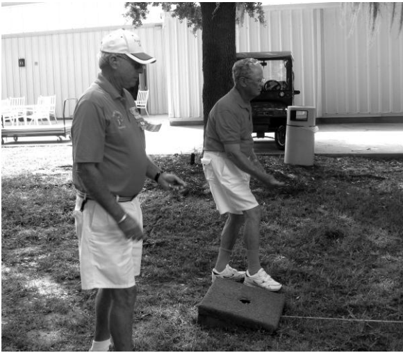
You need the perfect stance for Washer Pitching