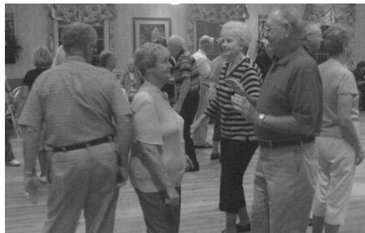
Dancing and having fun at the Installation Dinner