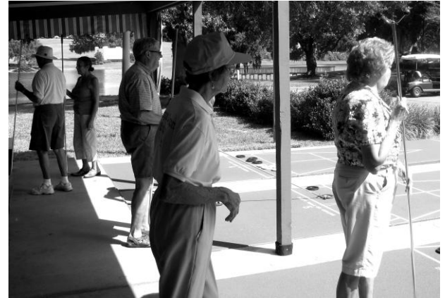
Who goes first?