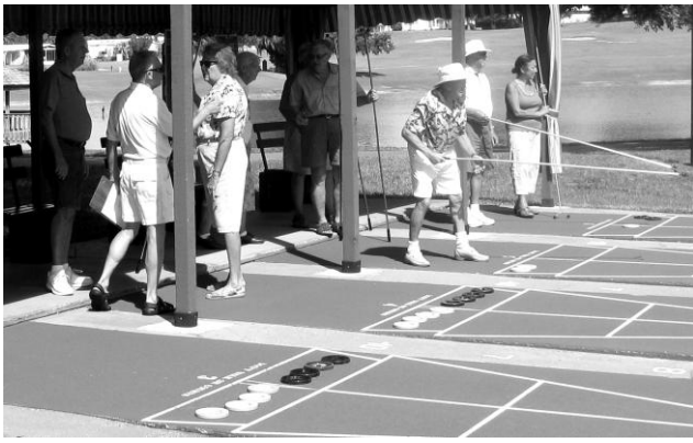
Finish with the rules, I'm ready to play