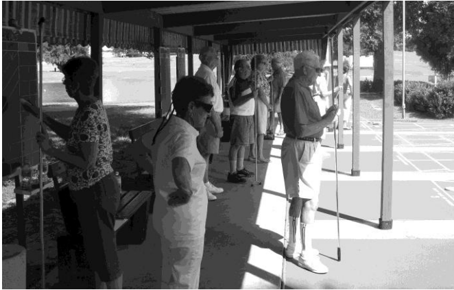
Make sure the scores are correct