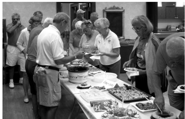
Getting energy for the games!!