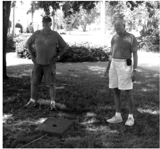
You can do it, get it in the little hole!