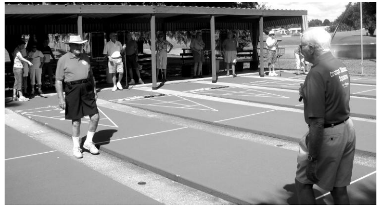
Shake hands then you can play