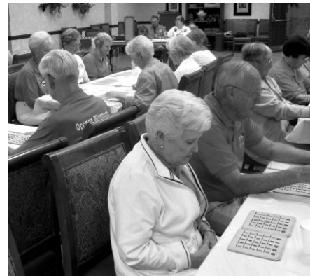
Bingo is a serious game. Are they studying their cards or asking for special help to win!