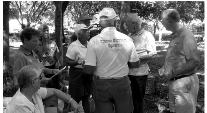
Does anybody know the rules to Bocce??